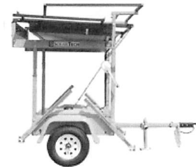
MB III shown folded for transport